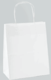
White Paper Bag Twisted Handle 33 x 34 x 18