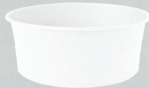
Salad Bowl 1300ml