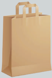
Brown Paper Bag Flat Handle 33 x 34 x 18