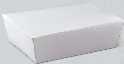
Lunch Box Medium