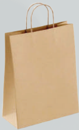
Brown Paper Bag Twisted Handle 33 x 34 x 18