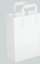
White Paper Bag Flat Handle 29 x 29 x 15