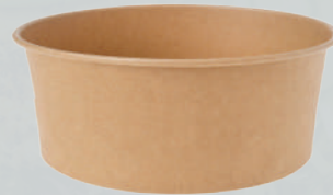
Salad Bowl 1300ml