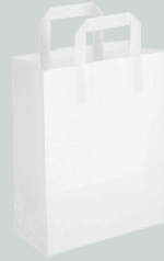
White Paper Bag Flat Handle 32 x 28 x 16