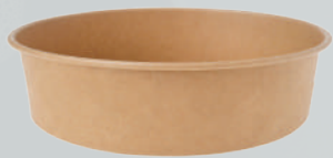
Salad Bowl 1100ml