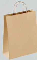
Brown Paper Bag Twisted Handle 32 x 28 x 16