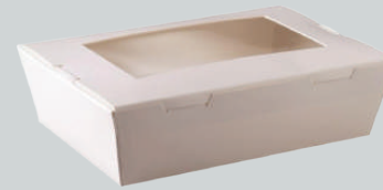
Paper Lunch Box with Window