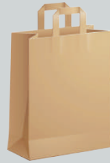
Brown Paper Bag Flat Handle 32 x 28 x 16