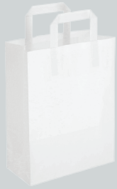
White Paper Bag Flat Handle 33 x 34 x 18