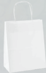
White Paper Bag Twisted Handle 32 x 28 x 16