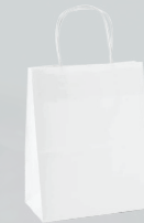
White Paper Bag Twisted Handle 29 x 29 x 15