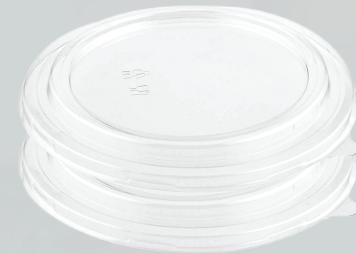
PET Lids Small / Large