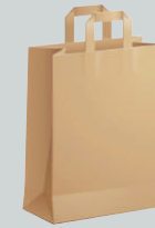
Brown Paper Bag Flat Handle 29 x 29 x 15