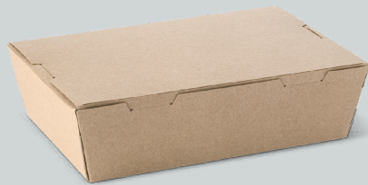
Lunch Box Medium