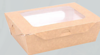
Paper Lunch Box with Window